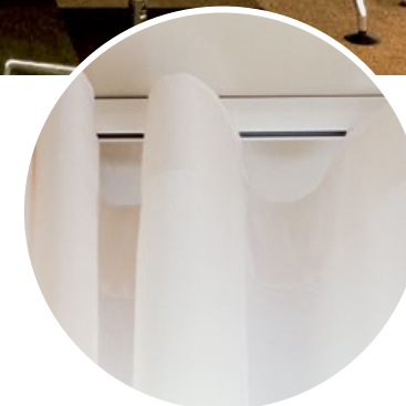
Hand or cord curtain tracks

Undulating curves when your curtains are closed transform into a neat stack-back when opened.