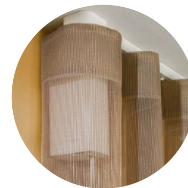
Electric curtain tracks