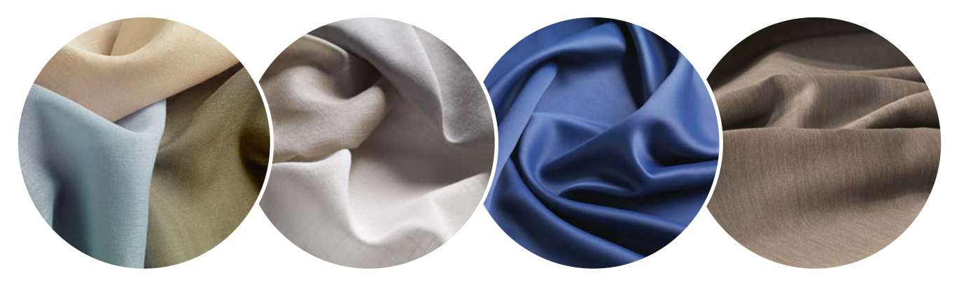
Our exclusive Colorama fabric available in 30 colours and washable up to 72°

Check out the Silent Gliss online fabric finder.