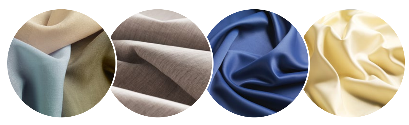
Our exclusive Colorama fabric is available in 30 colours and washable up to 72°

Check out the Silent Gliss online fabric finder.