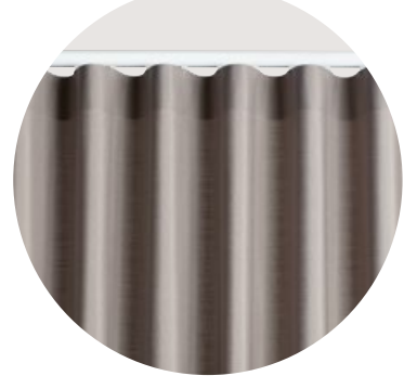
60mm Waves for a subtle, flowing finish.