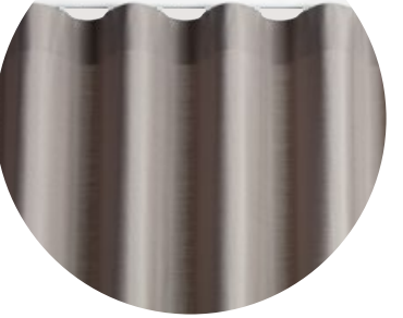
80mm Wave for a deep, defined shape.

Wave offers a contemporary design feature, created by a unique 2C glidercord inside the track which restricts the extension of the fabric. The end result is a continuous 'wave' effect when the curtains are closed and when opened, a neat stack back.